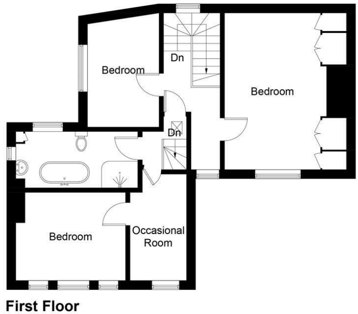
Illustration for identification purposes only, measurements are approximate, not to scale. (ID1264585)